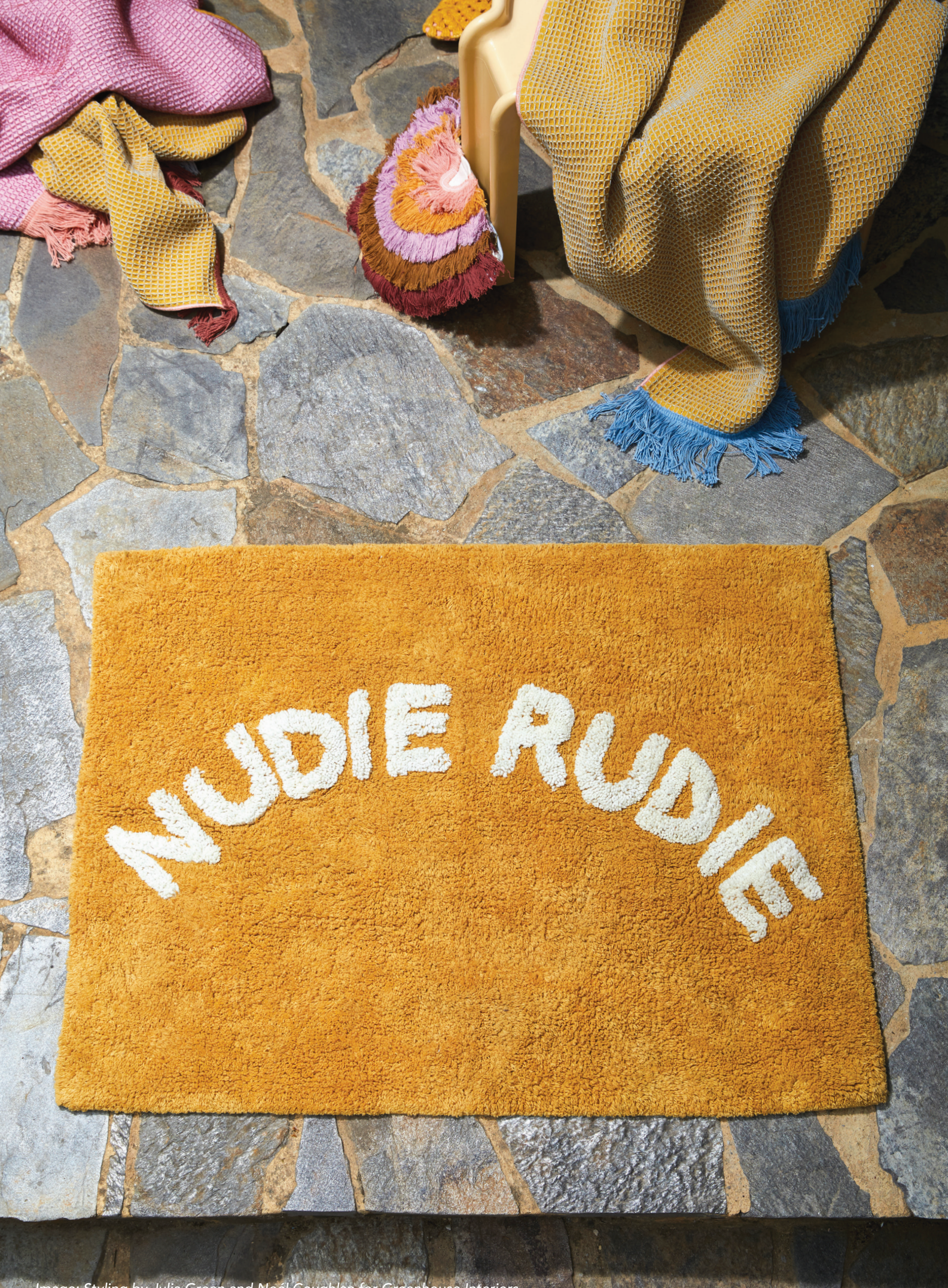
Image: Styling by Julia Green and Noél Coughlan for Greenhouse Interiors